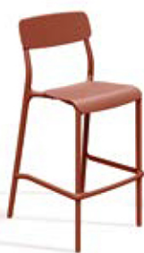
burnt brick 7600C