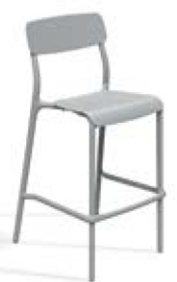
agate gray 423U