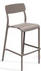
earthy toupe 410C

What's more, as the chairs are stackable, they can be easily rearranged and stored. Comfort and stability are ensured by the rubber chair feet.