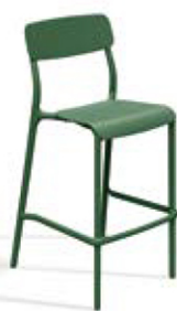
pine green 2411U